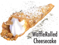
Waffle Rolled Cheesecake