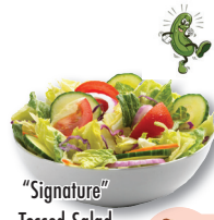
"Signature" Tossed Salad